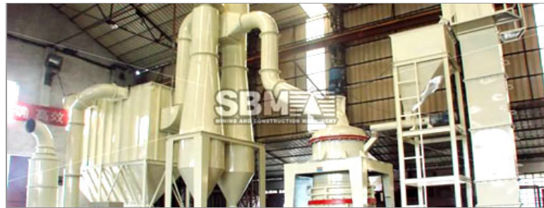
SCM Super-micro mill Specifications: