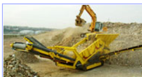
Stone Crushing Machine: We offer