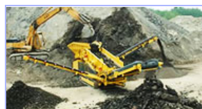
Concrete Crushing Machine: